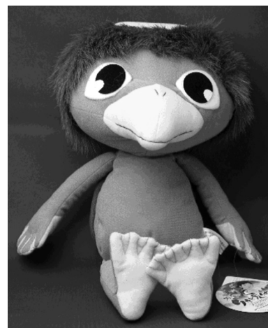
(b) Second image of Kappa