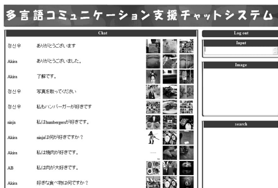
(a) Free talk in Japanese Language

values of the eight answers for questions (Q1), (Q2), and (Q3) were 4.50, 3.88, and 3.38, respectively. From these values, we can conclude that the function for message input was good enough while retrieved images were not satisfactory.