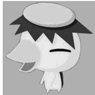
(a) First image of Kappa

To measure performance of the MCHI system, we conducted an evaluation experiment. Five participants joined the experiment. Each of the languages French, Vietnamese, and English was used by one participant while Chinese was used by two participants. We prepared a Japanese-Korean conversation in the experiment with respect to monsters in Japan. In the conversation, the word ‘Kappa’, which is used to specify a monster in Japan is used. However, ‘Kappa’ also has the meaning of cucumber, and it caused mistranslation. Each participant observed the conversation translated into his/her language, and specified mismatches of translated messages and corresponding images shown in Figure 8. As a result, four out of five participants pointed out the mismatch at the mistranslated