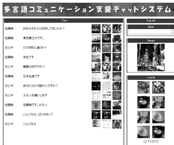
Figure 3. Overview of MCHI system