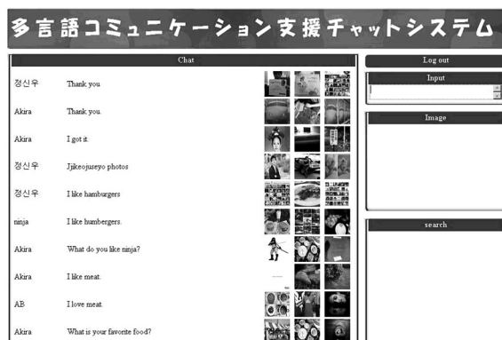
(b) Free talk in English Language