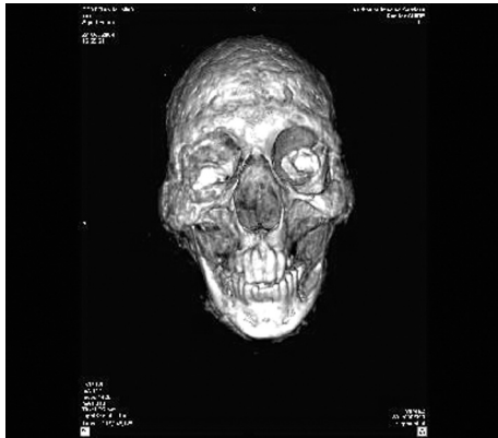
Fig. 2. 3D rendering of Ta-irty (Vitrea 2®).

were fed into a Terarecon ® 3D reconstructive program for initial analysis. Additional 3D digital imaging was performed by staff of Pinnacle Health System in Harrisburg, PA, using a Vitrea 2® work station (Figure 2).