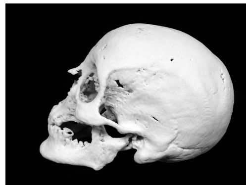
Fig. 5. Side view of the 3D-printed skull model.