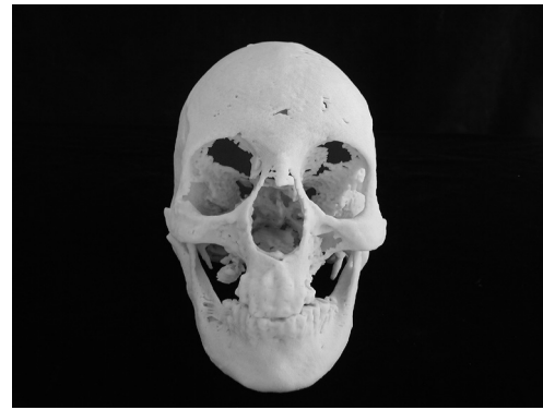
Fig. 4. Frontal view of the 3D-printed skull model.

complete three-dimensional model was created. The model was then removed from the printer, cleaned and infiltrated with cyanoacrylate for additional strength for the facial reconstruction process (Figures 4 and 5).