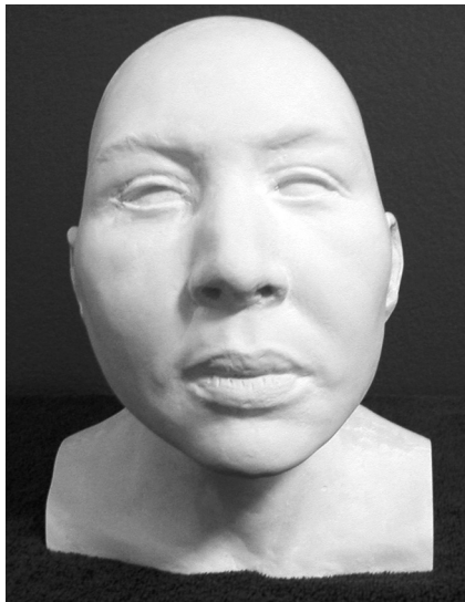
Fig. 6. Facial reconstruction of Ta-irty (F. Bender).

the face and head. The final reconstruction is presented in Figure 6.